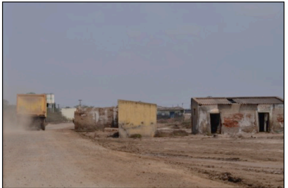
Coal Ash dust suspended in the air reduces visibility in the area

“In rainy season, water will stagnate till knee level and get mixed with bund (ash slurry water) water. Kids will see fishes in bund water, get excited and few kids have fallen inside that bund water” (Respondent 6).