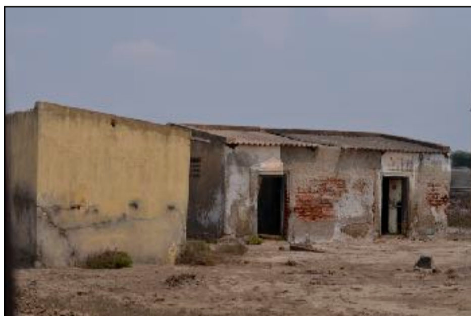
There is a lack of basic facilities like roads and housing in Seppakkam

This has clearly added to the stress of the people in addition to the pollution and related illnesses. They find it challenging at the time of emergencies: “We do not have any health facility in our village; either we have to go to Athipattu or Minjur. In Athipattu, Doctor will be available only till 12 pm in outpatients department. So we prefer to go to Minjur, which is approximately 5 to 6 kms away from Seppakkam. And, if someone has an emergency we have to wait until a person with vehicle is available” (Respondent 1).