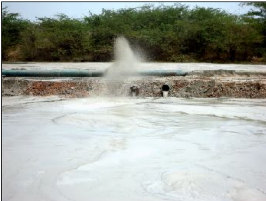
Coal Ash Slurry Pipelines leaking ash slurry in Seppakkam Village

“We get water from local panchayat tap. The water tastes bad, it is salty. We use that water for basic household needs like cleaning but not for drinking purposes. For drinking purposes we buy bottled water from outside” (Respondent 2),