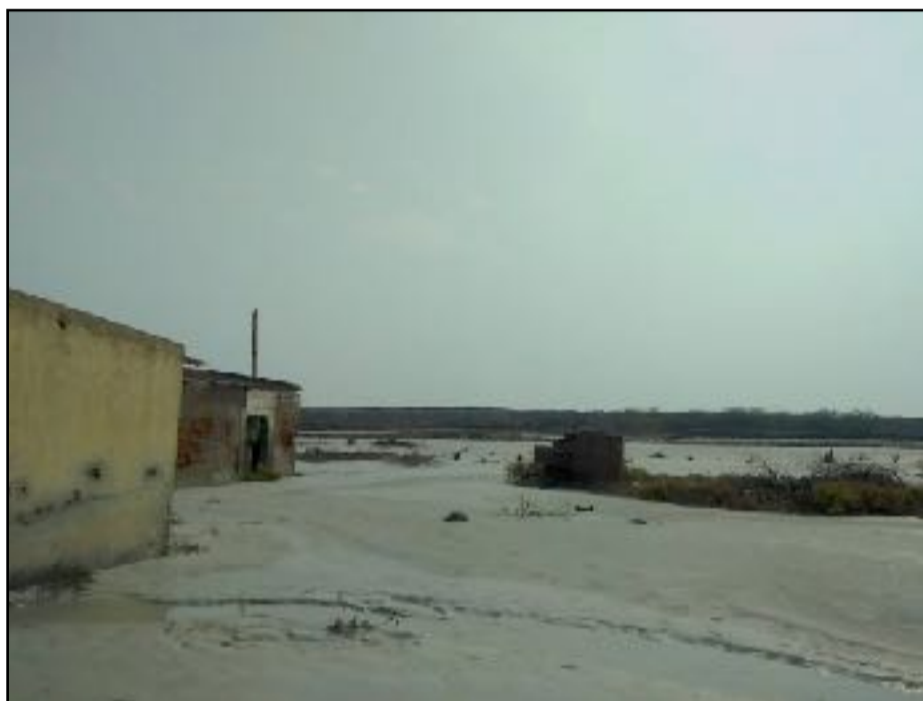
View of Homes Flooded by Ash Slurry from NCTPS .

A community based phenomenological study using In-Depth Interview (IDI) was carried out in Seppakkam. Respondents were residents aged above 18 years. The individuals with history of tobacco use (smoking and/or smokeless) and alcohol consumption were excluded from the study. IDI was conducted among seven individuals residing in Seppakkam village using an interview guide (Annexure I). The study participants were selected using purposive sampling. The respondents were identified and their verbal informed consent for participation obtained. The timing of the interviews ranged between 25 minutes to 45 minutes at a place comfortable for them. The recordings of the IDIs were then transcribed and important themes and statements were derived. The data collection was done for over a period of one month. Independent variables such as age, gender, education, occupation, personal history, medical history, duration of stay in the village, source of water and type of cooking fuel were collected in addition to the interview