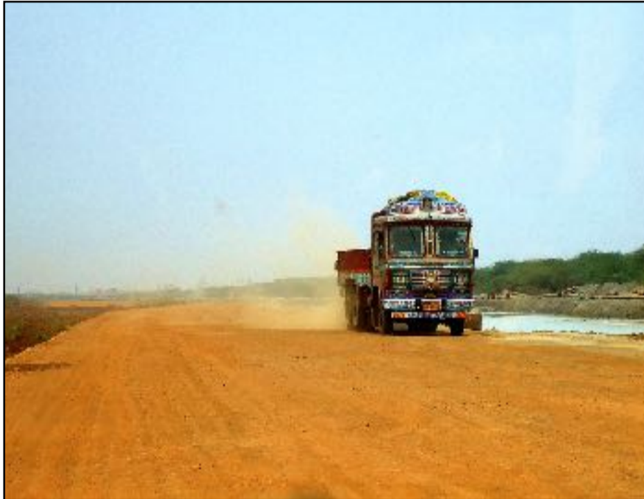
Ash Carrying Lorries Leaving a Dusty Trail

After TANGEDCO acquired farmlands and salt farms for the construction of the ash pond, the residents of Seppakkam have witnessed a dramatic transformation to the landscape. Large parts of the residential area is now perpetually inundated by coal ash dust and ash slurry leakages from the pipelines.