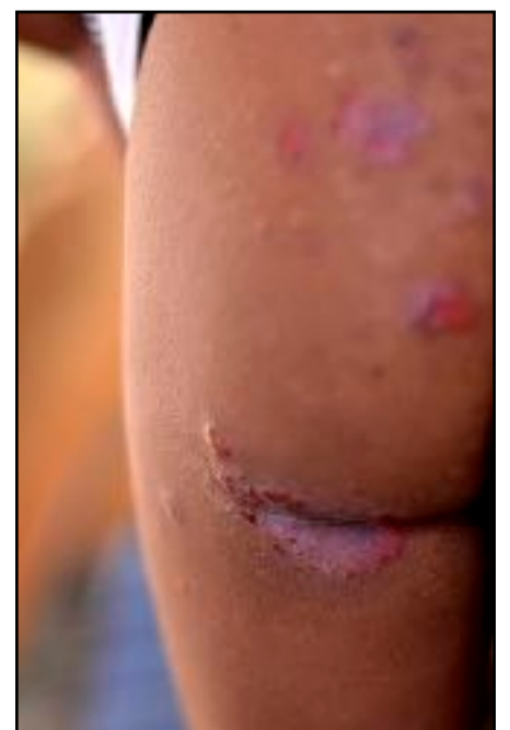
Skin lesions on Children and Adults due to exposure to ash contaminated soil in the area

“Almost every month we visit a doctor because of our ailments” (Respondent 1),