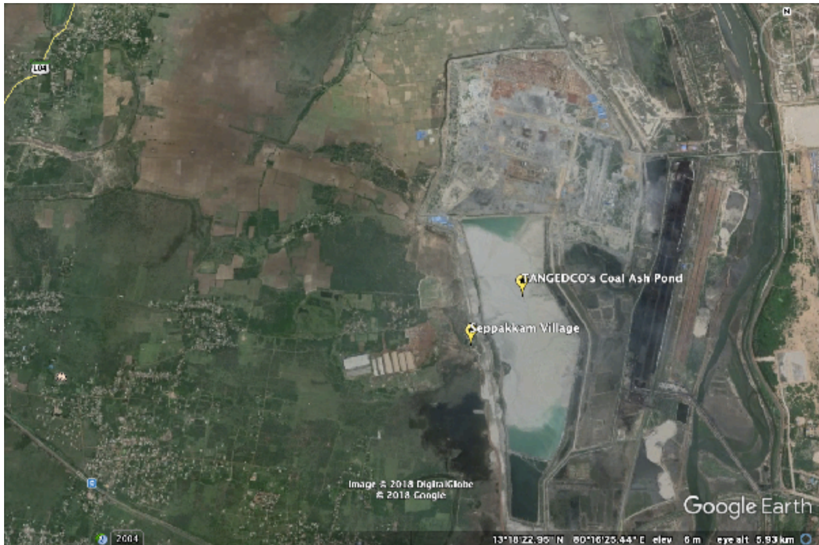
Map Showing Location of Seppakkam Village