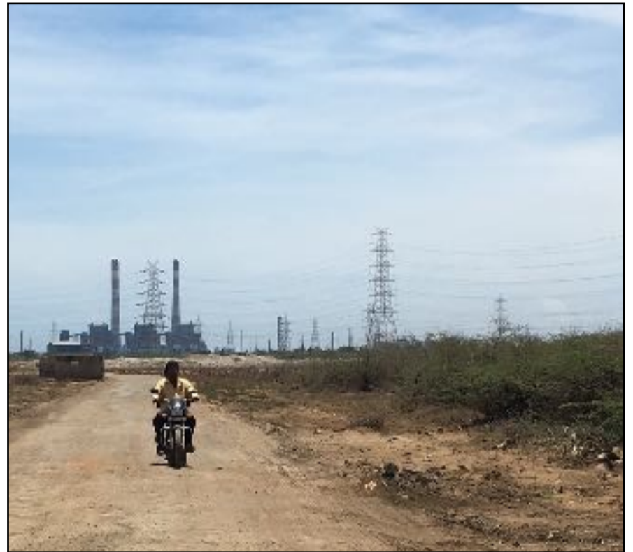
Living in the shadows of the power plant has made life difficult for the residents of Seppakkam

“We visit the doctor quite frequently and every visit, we spend around 700 to 800 rupees. Apart from this, we spend on petrol for the vehicle, so altogether we spend around 1000 rupees per visit. We scrape along and manage finances for the medical expenses. At times we keep our jewels in pawn shop and get money for medical expenses” (Respondent 4).