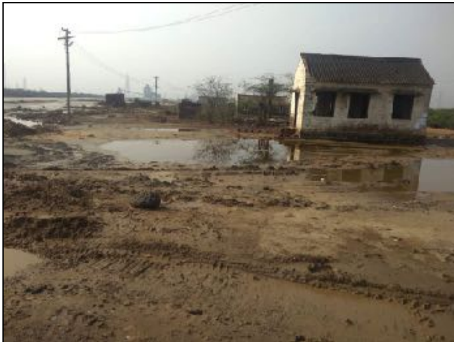
View of an abandoned house in Seppakkam Village

“In this village the maximum educational qualification of a person is only up to 10 th standard, because if they have to proceed with higher studies they will have to travel far for which there is no transportation facilities as of now. If someone gets fever, we have to look for a private transport or seek favors from anyone who has a bike to take the patient to the hospital” (Respondent 2).